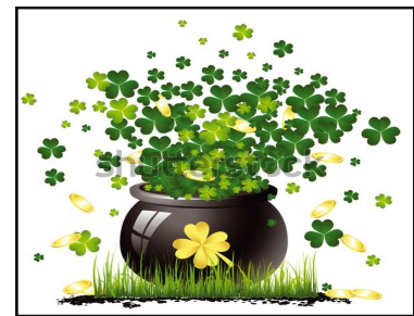
Shamrock Shrapnel, one of many weapons of these lucky, but not-so-charming, villains!

‘Fine,’ you might say, but can we further follow the trail of ill-gotten green? Would I still be talking if I couldn’t? Most tellingly, check out the price of gold in the days following 9/11, not to mention the going rate of pots and marshmallow-based cereals. And, who, pray tell, collects, nay HORDES! The demon metal? All of that sweet, sweet lucre flowed in the pockets of what Darby O’ Gill, world-renown Leprechaun expert, refers to as “The Little People.”