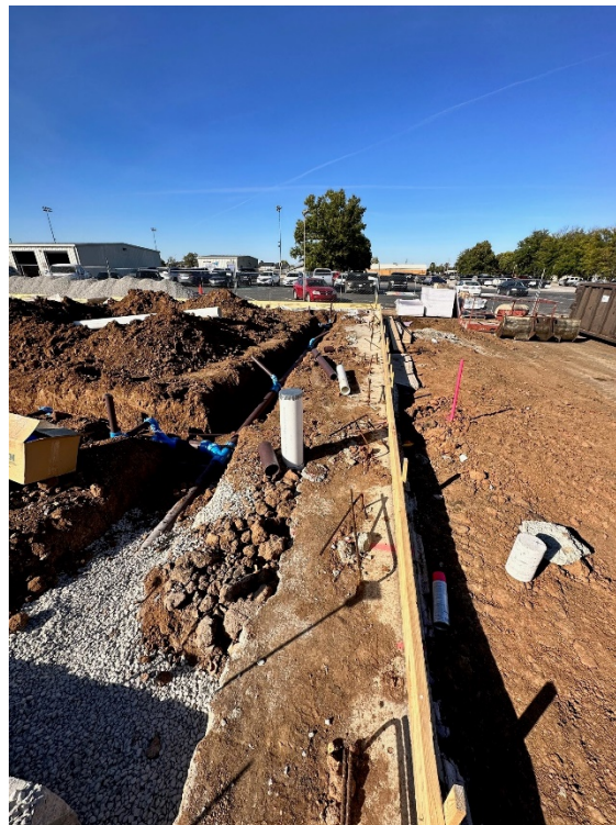
Slab edge forms in progress (October 17, 2023)