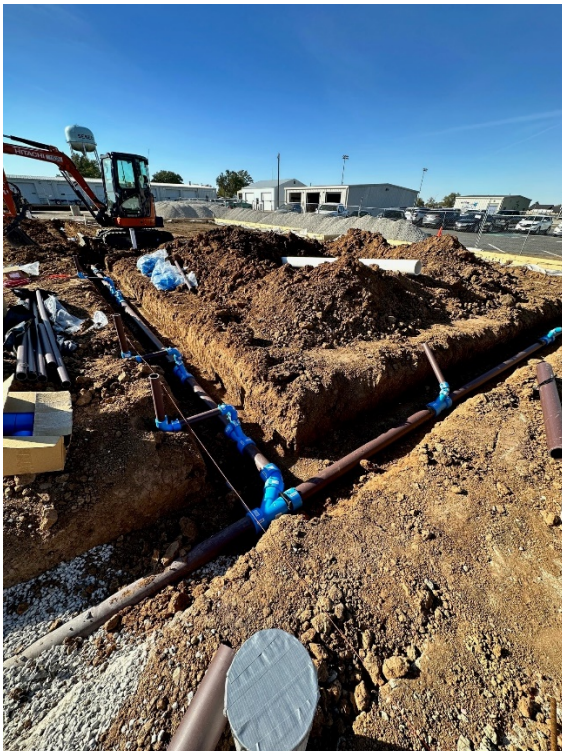
Chemical pipe installation in progress (October 17, 2023)