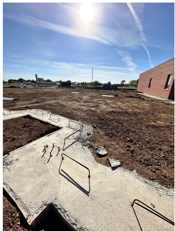
Concrete footings and anchor bolts complete (October 17, 2023)