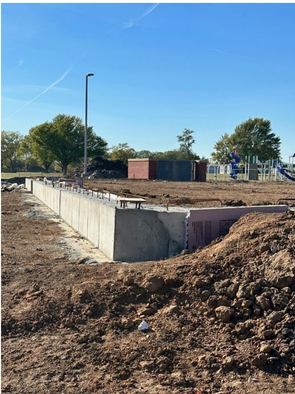
Concrete footings and anchor bolts complete (October 17, 2023)