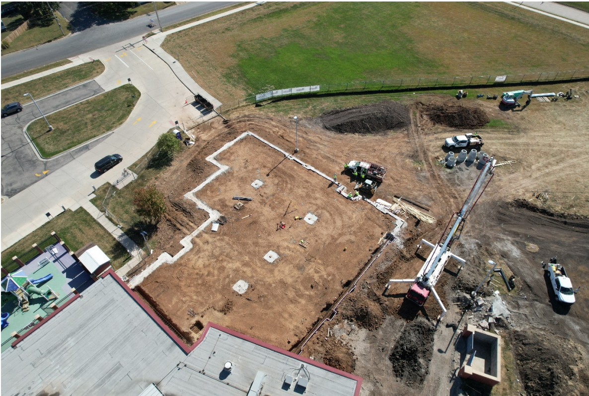
Concrete footings in progress (October 11, 2023)