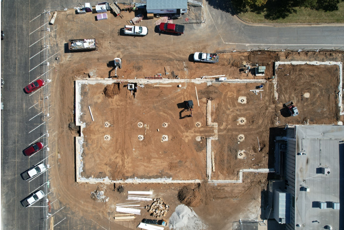
Concrete footings complete. Below slab plumbing and electrical in progress. (October 11, 2023)

High school below slab plumbing and electrical installation is in progress, slab forms are 75% complete, and structural steel delivered 10/18/23. Elementary school addition footings are complete.