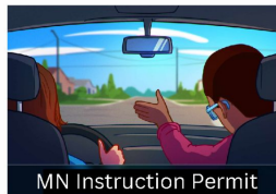
MN Instruction Permit