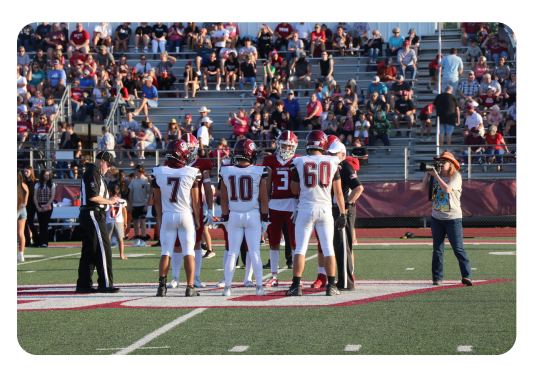
CAPTAINS MEET AT MIDFIELD

Look at all the fun we've had over the past month! Send your Ironmen pictures to fbranstetter@npsok.org!