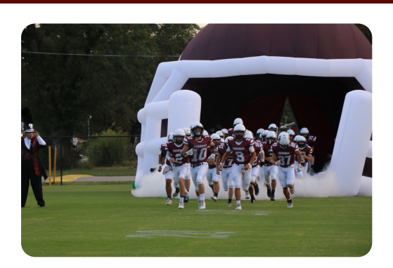
IRONMEN STORM THE FIELD

Ironmen cheerleaders join the band in drum cadence.