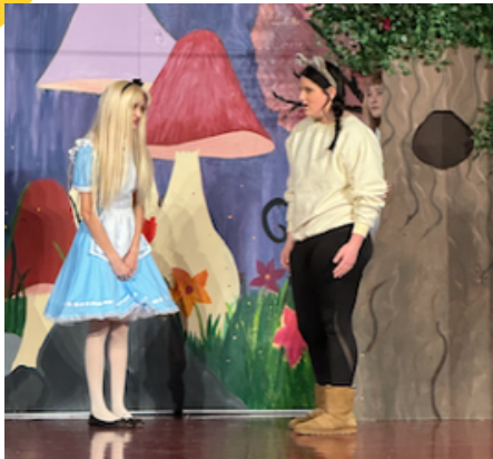
Alice in Wonderland