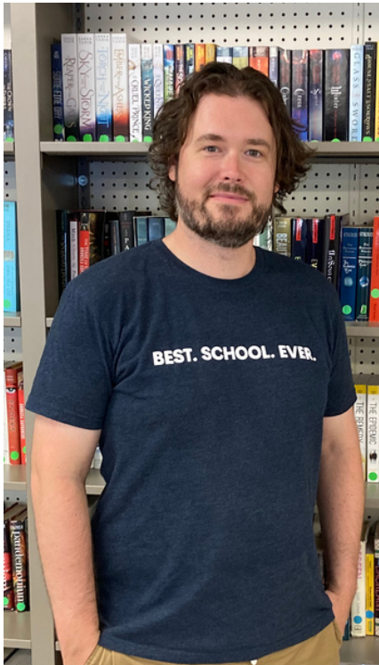
Henry VanLoon Shepherd High School ELA Teacher