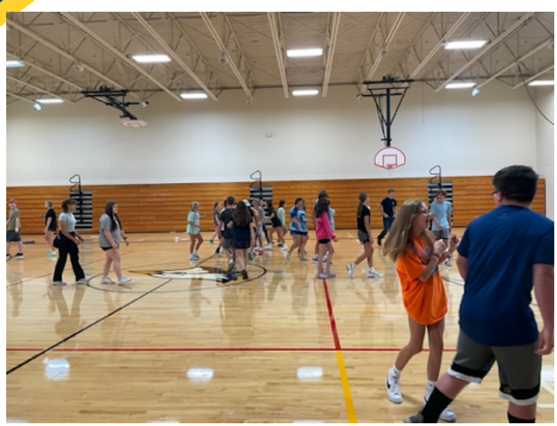
WEB 8th Graders training activities