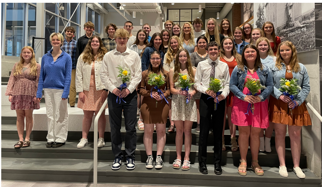
Induction into National Honor Society 2023

There were two boys that attended Badger Boys State and two girls that attended Badger Girls State in 2023. One student participated in the Wisconsin Leadership Seminar that year. Additionally, there were 18 graduates that were part of the National Honor Society.