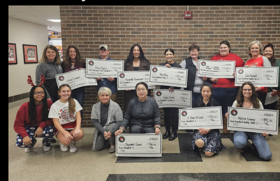
Logansport High School Alumni Association grant recipients recognized at a home basketball game.

Founded in 2019, the Logansport High School Alumni Association is a nonprofit organization proud to champion excellence in our schools. Over the past three years, we've awarded more than $20,000 in grants to support staff and student initiatives—funding classroom projects, programs, clubs, and enrichment opportunities that help Berries thrive in and out of the classroom. None of this would be possible without the generous support of our alumni and community.