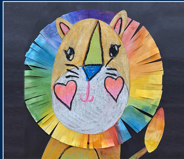
Tashfia Arysha, Grade 2