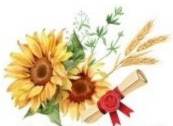
Jerri Walker DePriest Endowment Fund

Donations of time and funds to the Jerri Walker DePriest Endowment Fund and the Ranger Pride Education Foundation have created an amazing support system for Dufur graduates by providing unprecedented scholarship opportunities. Thank you for helping us build a brighter future!