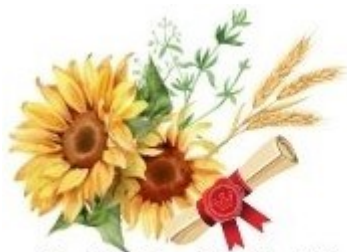
Jerri Walker DePriest Endowment Fund

Donations of time and funds to the Jerri Walker DePriest Endowment Fund and the Ranger Pride Education Foundation have created an amazing support system for Dufur graduates by providing unprecedented scholarship opportunities. Thank you for helping us build a brighter future!