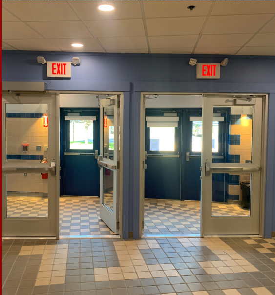
Welcoming vestibule at Carl J. Lamb

The Sanford School Department would like to recognize our custodial and maintenance staff's hard work over the summer to make our educational environment clean, safe, and inviting to everyone.