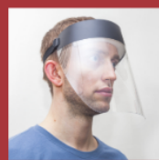
Plastic Face Shield (with no mask)