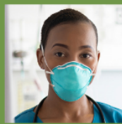
N95 Mask (no valves)