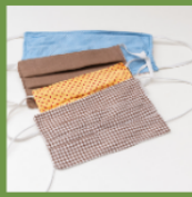
Cloth Face Covering