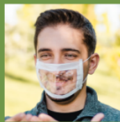
Face coverings with vinyl windows (for use in hearing-impaired community)