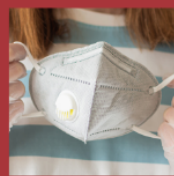
Any mask with outlet valves