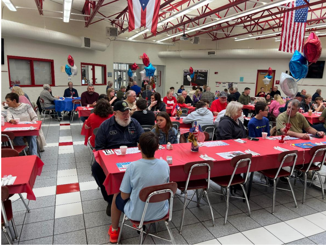
Columbiana Middle School students enjoy breakfast with their Veterans