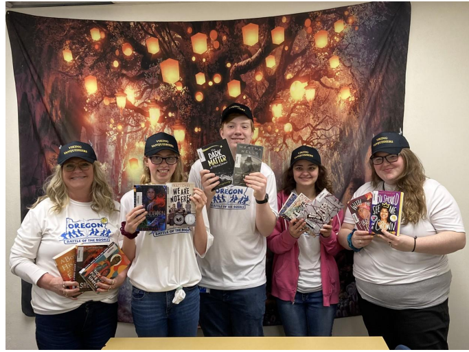
Last year's SHS OBOB team placed 6th at the State Competition!