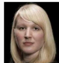
GRADES 9-12 CHELSEA PITCHER