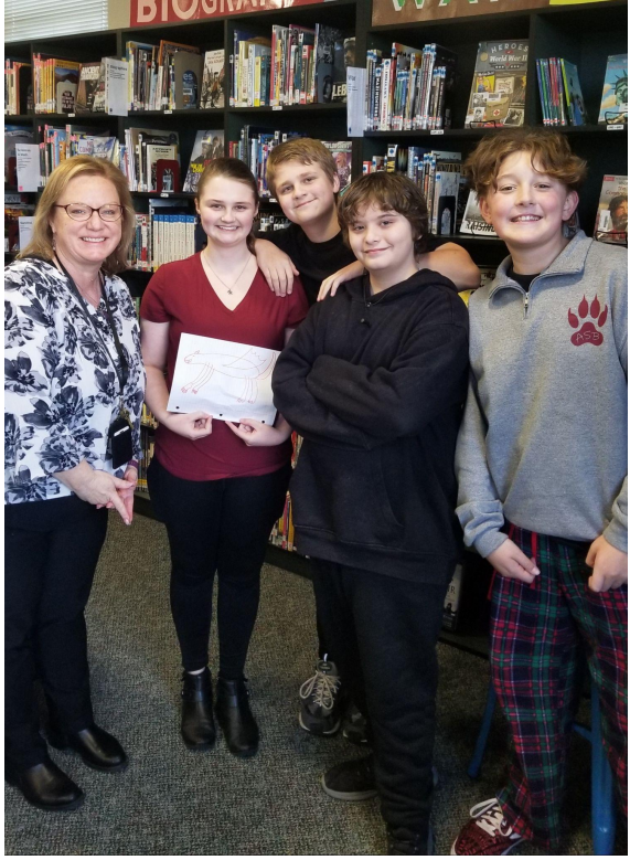
Here's the SMS OBOB team that will be advancing to Regionals!