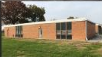
Kindergarten & Vocational