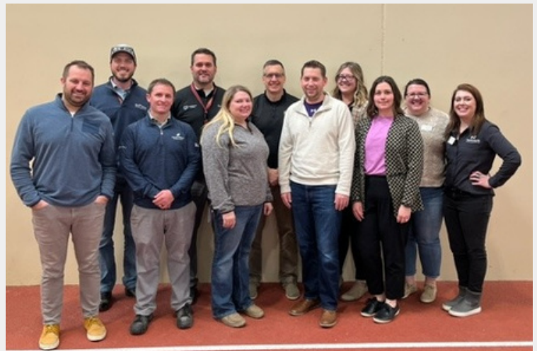
Weller Brothers, STC, HSD Staff, & SD Dept. of Labor & Regulation gather to celebrate RYAP at HHS (Feb. 2023)

The Freshman Academy (2023) and East Middle School (2023) will expand CTE offerings for 6-9th grade learners and a career exploration course is being developed in partnership with many entities to launch for 9th graders at the FA for the 2024-25 SY.