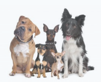
Requirements and equipment needs will be furnished upon registration. Aggressive dogs will be dismissed.