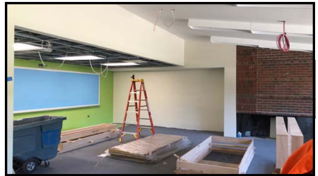
Blythe Park Elementary School