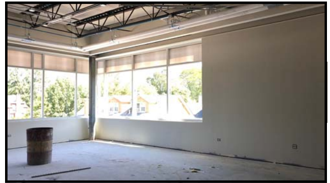
Ames Elementary School