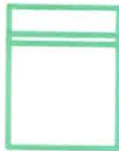
PLASTIC STORAGE BAGS 1 Gallon Resealable