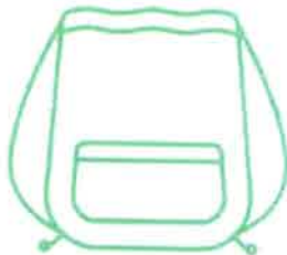
CLEAR AND MESH DRAWSTRING BAG 16"x13"