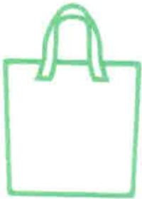
CLEAR TOTES 12"x6"x12