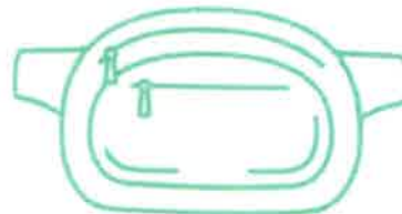
CLEAR WAIST BELT BAG