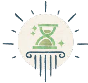
EXPLICIT INSTRUCTION, INTERVENTIONS, & EXTENSIONS