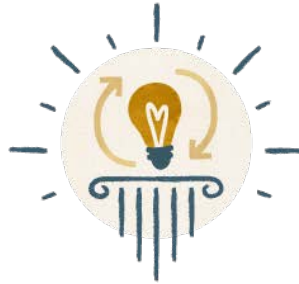
ONGOING PROFESSIONAL GROWTH