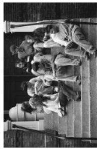
Students understand how decisions they make today will affect their future—and they’re taking a stand!