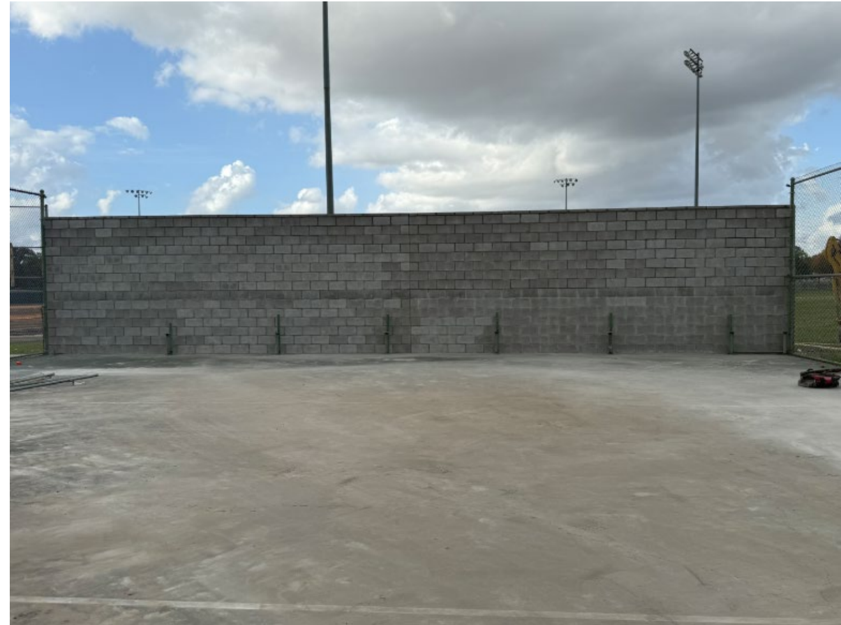
Tennis Court Picture of new practice wall.