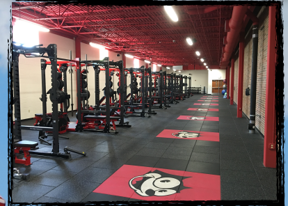
Life Fitness Center