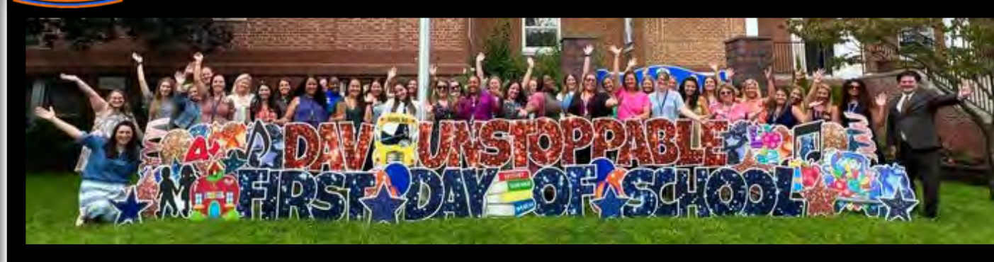
Davison Avenue Intermediate School