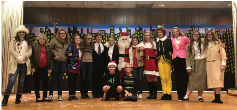
The Company of Elf: The Musical

As many may know already, all of the proceeds from productions put on by Welch Community Theatre go directly to the Welch Public Schools Backpack Nutrition Program, which helps provide food to underprivileged families in the community. Since the formation of Welch Community Theatre in May 2017, local students have produced two musical theatre performances and raised over $5,000 for the Backpack Nutrition Program. The two night production of Elf: The Musical raised $2,300.