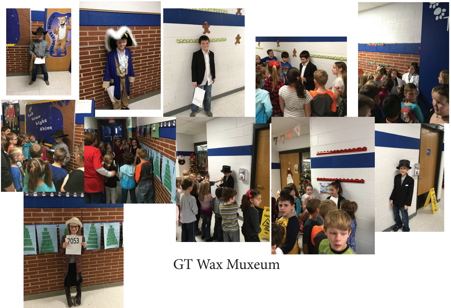
GT Wax Muxem