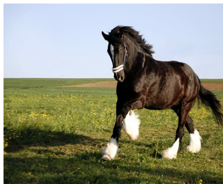
The above pictured horse is a shire.

Did you know that shires are the biggest horse in the world. Their hooves are 68 inches long or 173 centimeters. Shires weight is 1870 to 2430 lb for geldings and stallions/boys. And for mares/girls 1,800 and 2,400 pounds.