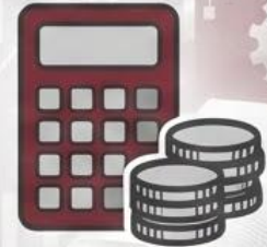
Total Funding - 6/25