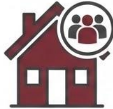
Local Funding - 6/25