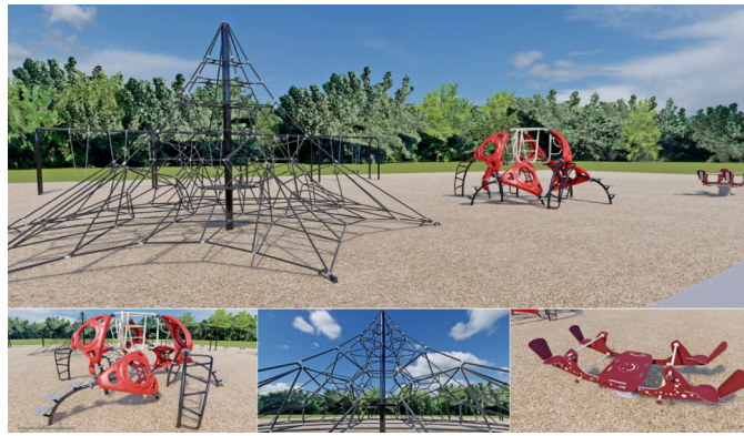
Playground conceptual renders