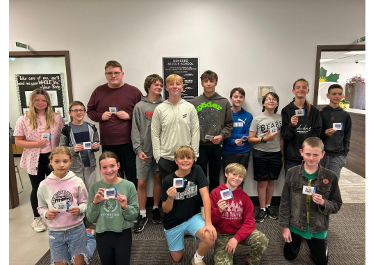
Math Khan Academy Level-up Champs

In this section in 2025-26 you will see student-centered highlights from sports, activities, music, volunteering, individual accomplishments, classroom learning, teamwork, collaboration, and more. Get ready to “celebrate the great” at GMS!