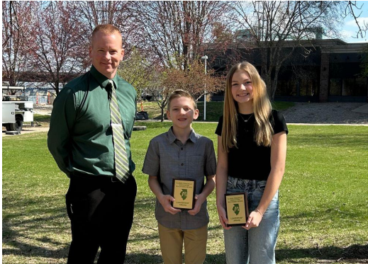
IL Principals Association Student Leader Award