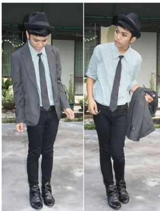
Hats are not allowed. Jackets and ties are discouraged because it will be HOT in the gym.