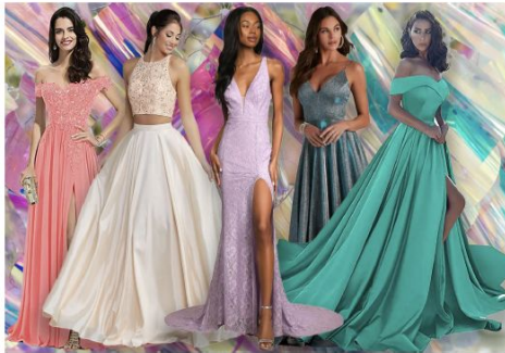
Save formal dresses for high school prom.