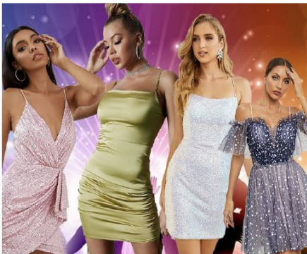
Save semi-formal dresses for high school homecoming.