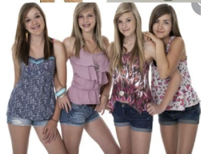
Collared shirts or t-shirts with khakis, jeans, or shorts.