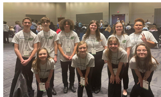
(Shout out to our Midwest ACDA Honor Choir)