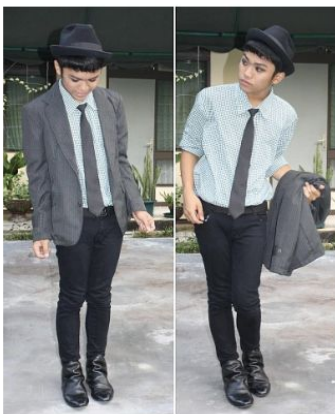
Hats are not allowed. Jackets and ties are discouraged because it will be HOT in the gym.