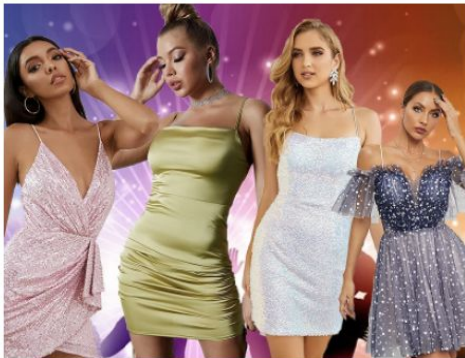
Save semi-formal dresses for high school homecoming.