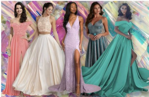
Save formal dresses for high school prom.