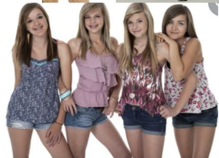
Collared shirts or t-shirts with khakis, jeans, or shorts.