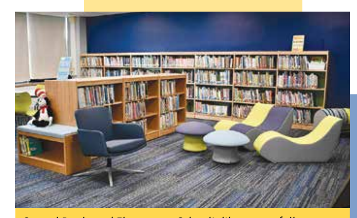
Central Boulevard Elementary School's library was fully renovated during the summer of 2023.