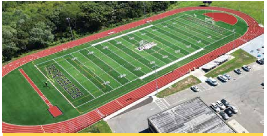
The new and improved athletic facility at John F. Kennedy Middle School