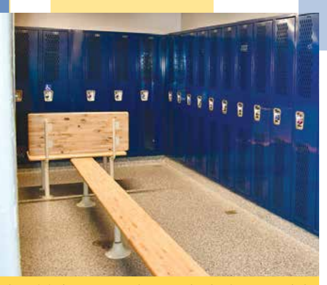
The girls locker room at Bethpage High School was expanded to include new lockers and benches for student athletes.