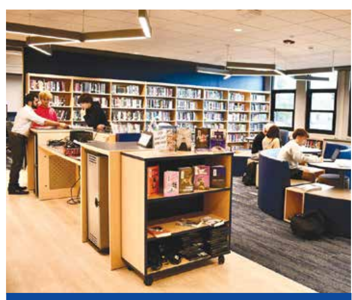
The Bethpage High School library was renovated into a modern space for students to study in.