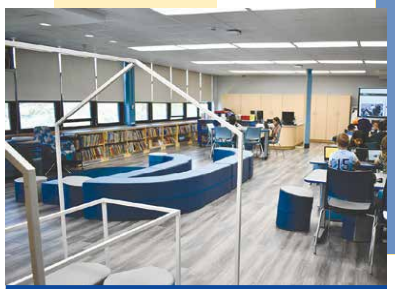
Charles Campagne Elementary School's newly renovated library features new flexible furniture.