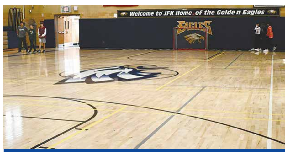
John F. Kennedy Middle School's gymnasium floor was redone, allowing for a safe surface for students to play on.