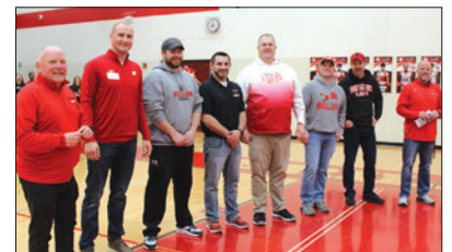
2003 & 2004 Football State Champions