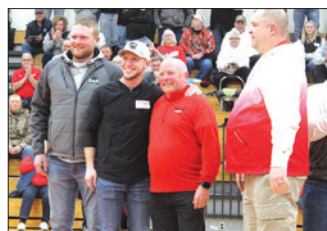
2012 Boys Basketball State Champions