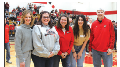
1999 Girls Track & Field State Runner-Up