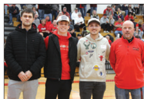
2019 Boys Cross Country State Runner-Up