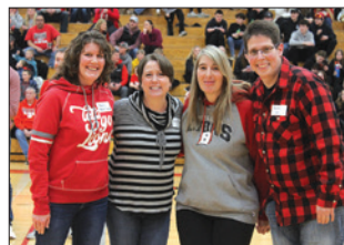
1993 Girls Track & Field State Champions