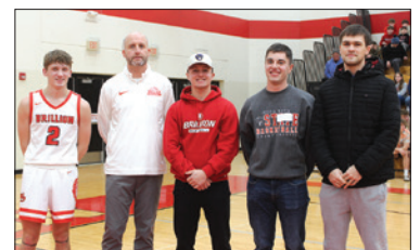
2023 Boys Basketball State Champions