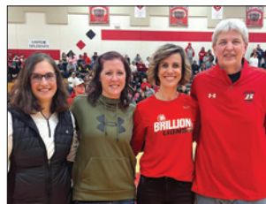
2001 Girls Basketball State Runner-Up