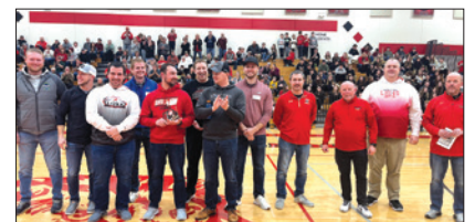
2010 Football State Champions