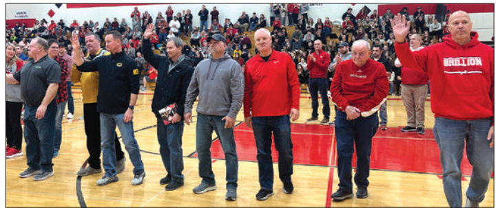
1984 Football State Champions