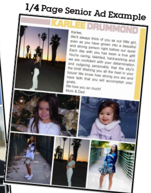
1/4 Page Senior Ad Example

Submit photos, write-up, & questions by email to tdyearbook@mc4kids.com