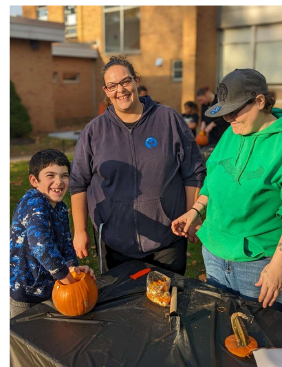
Pumpkin Carving at Keane