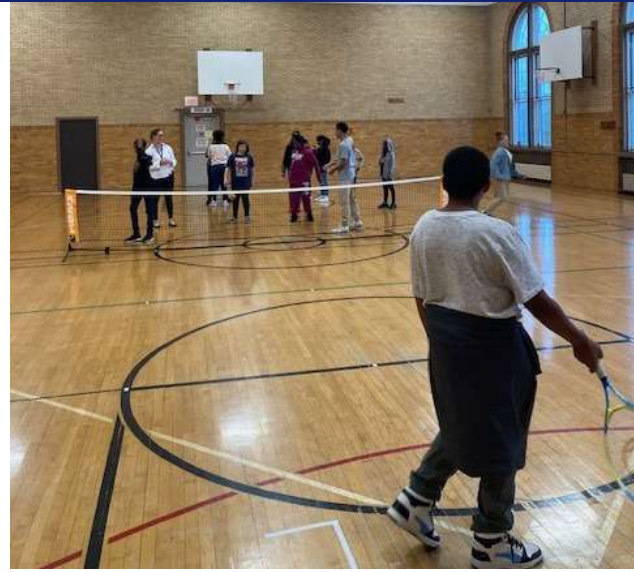
Tennis Lessons from 15 Love

Afterschool Programming is off to a great start at several schools across the district. Take a look at what our bright scholars have been up to in the month of October!