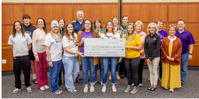
Thank you, Greenville High School Athletic Boosters! ($10,000)