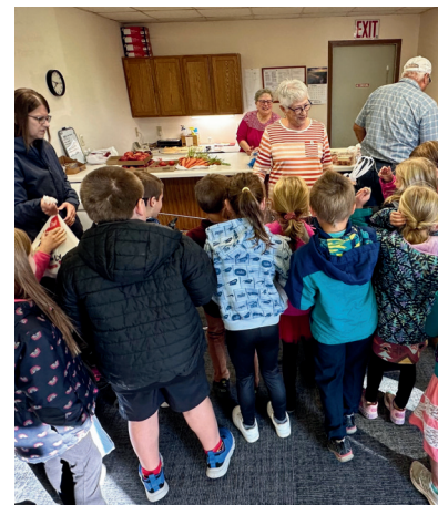
2nd Grade Class