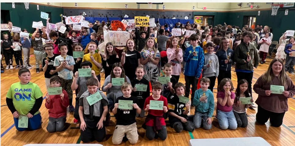
4th through 6th grade winners