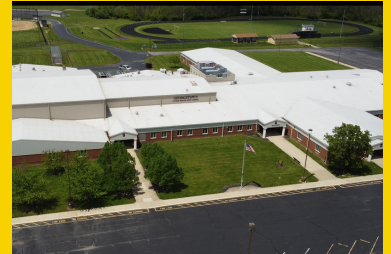
Georgetown Jr/ High School