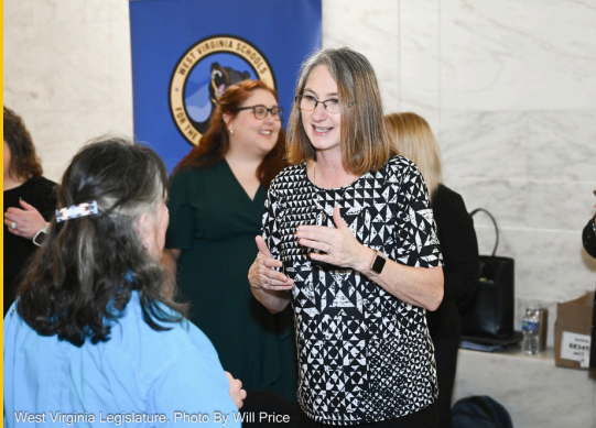
West Virginia Legislature.