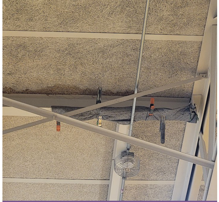
GYM CEILING /TOWELS CATCH LEAKS - INTERIOR