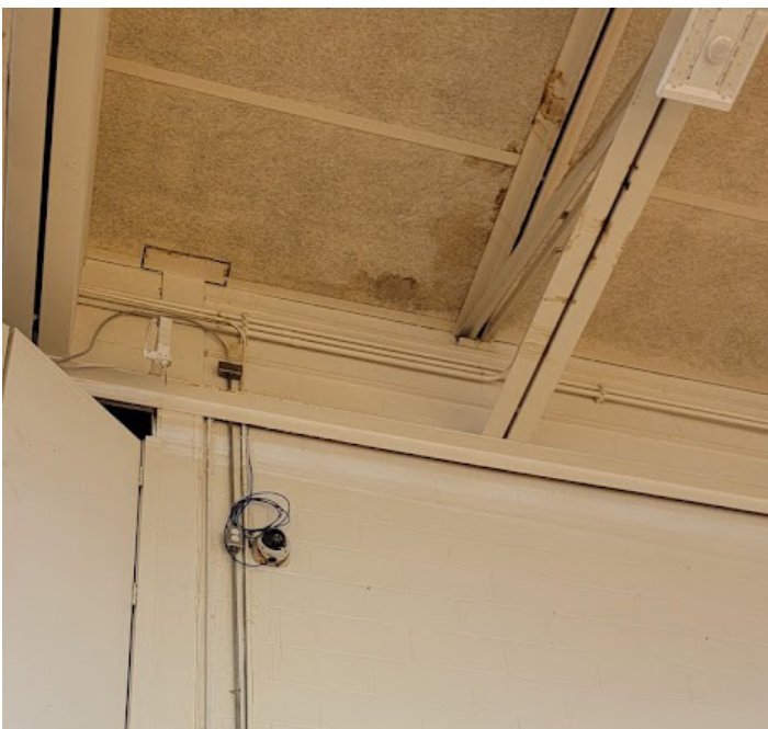
ACTIVE LEAK GYMNASIUM - INTERIOR