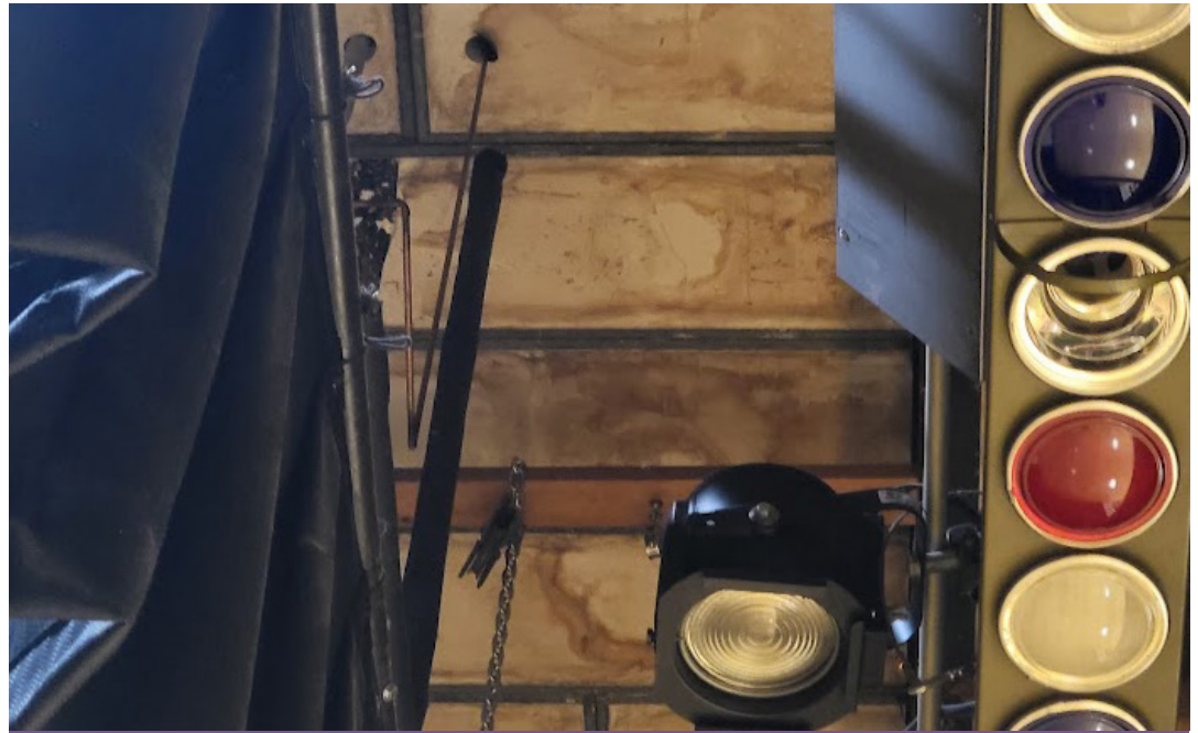
WATER DAMAGE ABOVE AUDITORIUM STAGE- INTERIOR