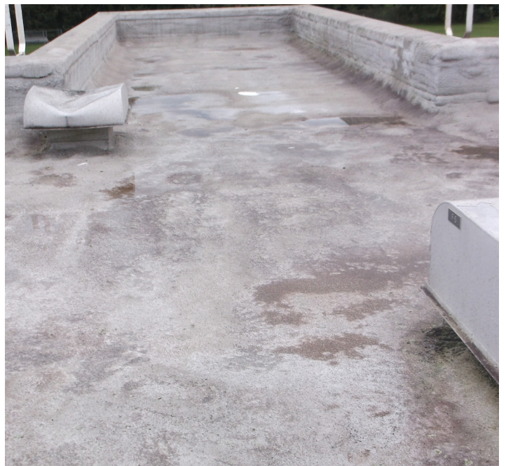
OUT-OF-WARRANTY ROOFING- EXTERIOR