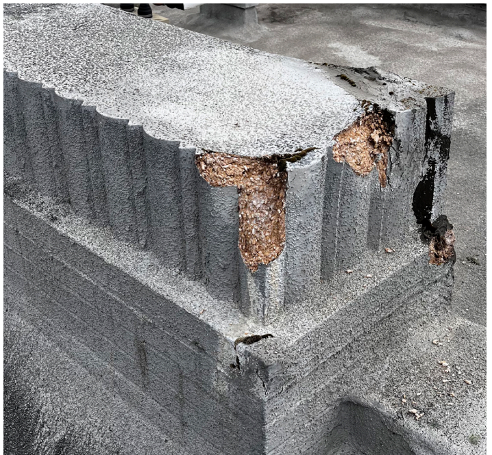
FAILING ROOFING & COPING- EXTERIOR