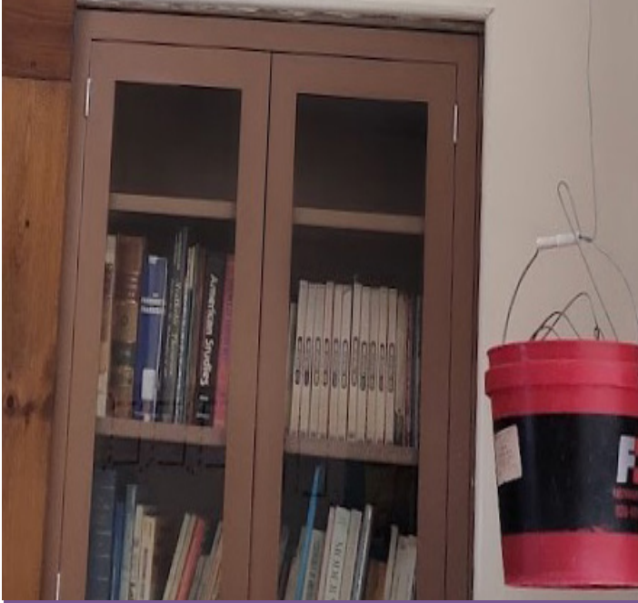
BUCKET CATCHING LEAKS - INTERIOR