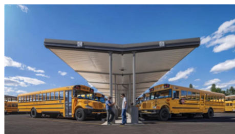
Current Transportation Facility (nearly 100 years old)!