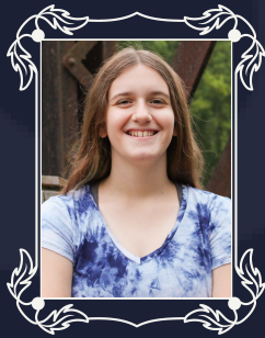
Morgan Curry Monroe Community College