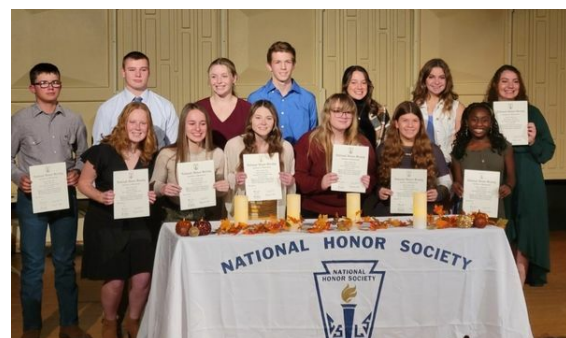
National Honor Society Inductees