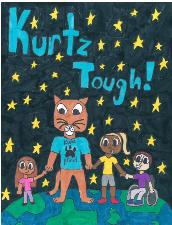
Adelynn Felt: 23/24 Yearbook Cover