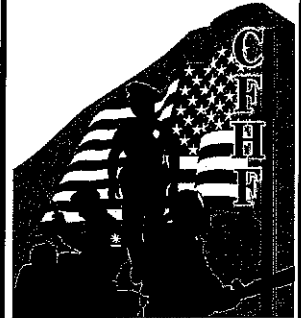
Chautauqua Fallen Heroes Fund

The Chautauqua Fallen Heroes Fund was established in 2001 to benefit the families of firefighters, police officers, EMS Personnel, and other local "uniformed heroes" who have been killed in the line of duty. To support those who are interested in careers in public safety, scholarships will be awarded on an occasional basis. Applicants must be pursuing a career in Law Enforcement, Firefighting or Emergency Medical Services.