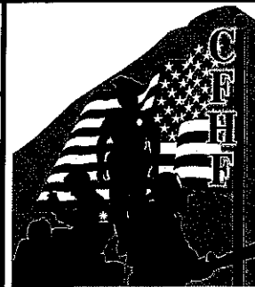
Chautauqua Fallen Heroes Fund

The Chautauqua Fallen Heroes Fund was established in 2001 to benefit the families of firefighters, police officers, EMS Personnel, and other local "uniformed heroes" who have been killed in the line of duty. To support those who are interested in careers in public safety, scholarships will be awarded on an occasional basis.