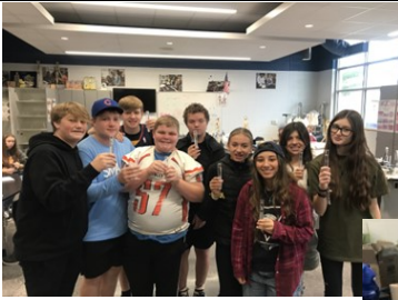
← Principles of Bio-medical students seeing their own DVA.