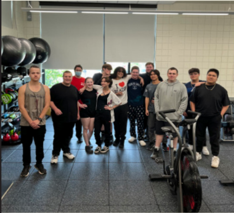
Wellness Club Members in the new gym!

Overall, joining wellness and working out is incredibly beneficial for you both mentally and physically. It is a great aspect of Cairo-Durham High School and will help many current and future students immensely. The wellness club meets across from the transportation office on Mondays, Tuesdays, and Thursdays. All you have to do is pass your classes, and the school provides a 3:30 late bus so don't worry about transportation.