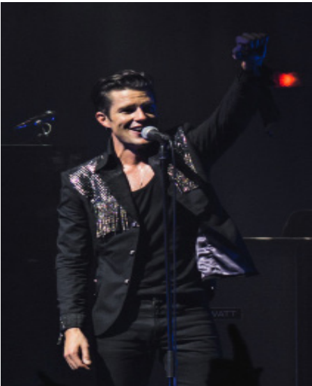
Brandon Flowers of "The Killers".

Some songs that I thought were pleasant were "Your Side of Town" because it added much-needed uniqueness to the album, differentiating from the rest by adding a fast-paced, upbeat, and electronic feel. "Jenny Was A Friend Of Mine" caught my attention because of the vocals, the darkness of them, the accompaniment, and the thought-provoking murder and betrayal references. The tracks on the album have a very video-gamey, envy-filled, and distraught feel