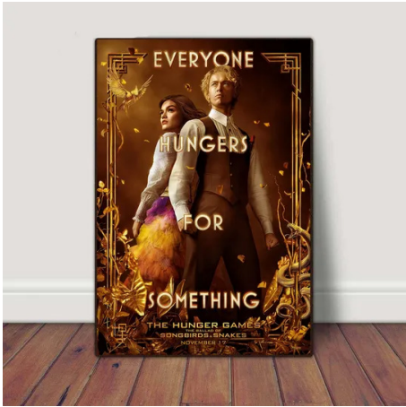
Poster for 'The Hunger Games: The Ballad of Songbirds and Snakes', found on printerval.com, and sold by Tienmuoide-sign.