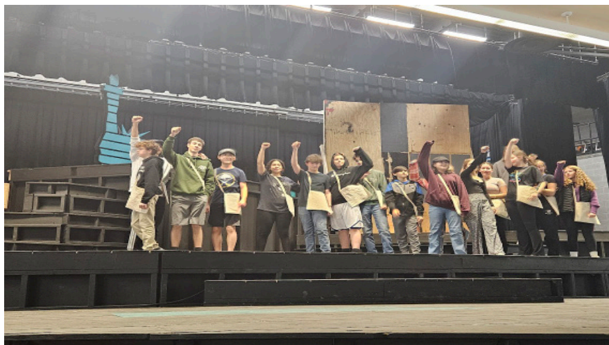
The cast of Newsies rehearsing on Wednesday, February 7, 2024

The next step of production is the audition process, the day most theater kids dread. Most students try to add a unique trait to their audition for it to stand out from the others. However, one of our casting directors, Mr. Fisher, says, "I'm impressed by individuals with natural